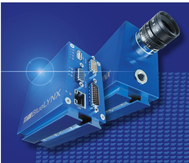
The intelligent camera mvBlueLYNX provides a basis for the development of the mvSMR.

With the proceeding development of the industrial image processing nowadays an automated usage is possible, where it was not thinkable either economically or technically yet. In the meantime robust and cost-effective image processing solutions can be developed shortly with the help of more powerful hardware components and optimized software components.