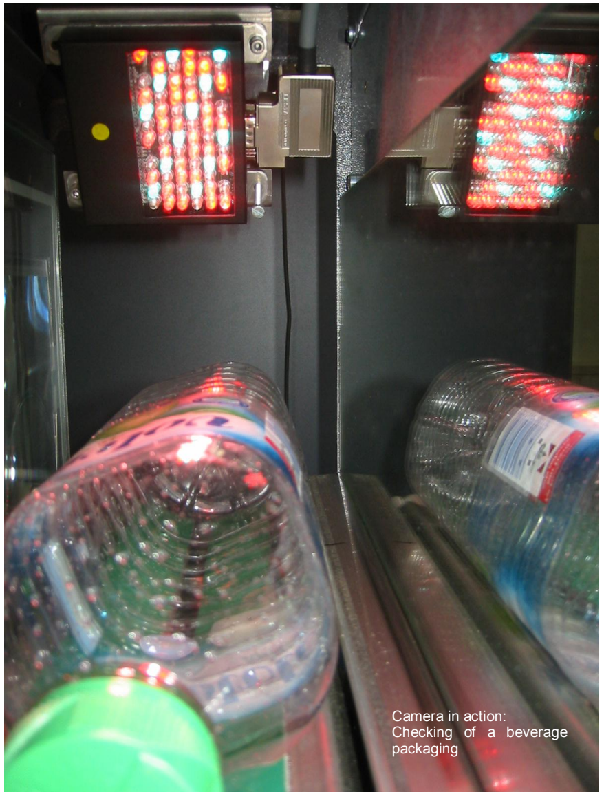
Camera in action: Checking of a beverage packaging

At the turn of the millennium it was the current opinion, that image processing would be too expensive for a deposit system. Years later image processing became accepted economically and represents the central unit for a reliable and robust receiving of disposable beverage packaging. Although system and requirements changes have to be included in short time, since May 1 st , 2006 cans and disposable beverages packagings can be received Germany-wide in a consistent deposit system. Some people could understand the statement "in short time" cynically. After all since 1991 with the